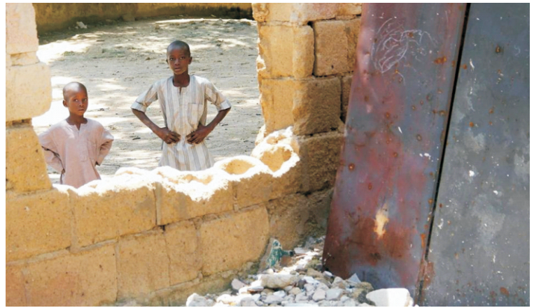
That was our school-Providing scholarships and qualitative education is a stand against the insurgency.

Adamawa state relies solely on the Federation allocations. The insurgency has dampened her economic outlook but a clear path to sustainability is possible. " -- www.yourbudgetit.com/data/adamawa